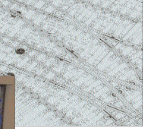
...and then output as detailed working drawings...