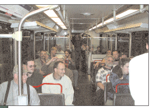
On the way back to the hotel after a long day, the group learns even more about Metrolink from our guide.

... from across the Mississippi River in Illinois.