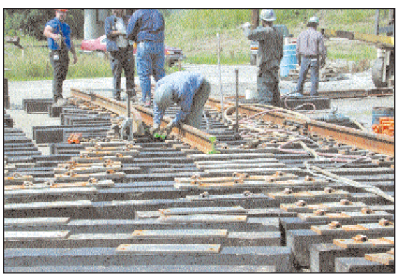
Then it was off to the Koppers trackwork manufacturing and remanufacturing facility plant in Alorton, III. Dedicated to the highest standards in quality, this facility makes complex track panels and a variety of special trackwork products. In the center of this photo, an example of rail that has been curved with the new rail bending machine can be seen.