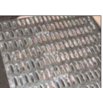
...packed in specially labeled boxes and palletized. The order being run in this shot is for 6.2" x 7" plates for Burke-Parsons-Bowlby in West Virginia.