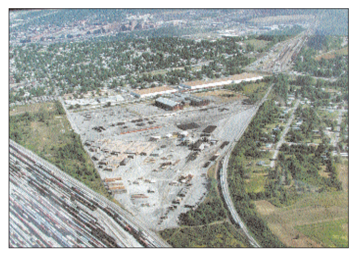
...Kerr-McGee's Madison plant is a class act...