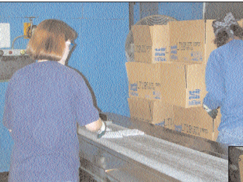
End-plates for ties come off the stamping line and are...