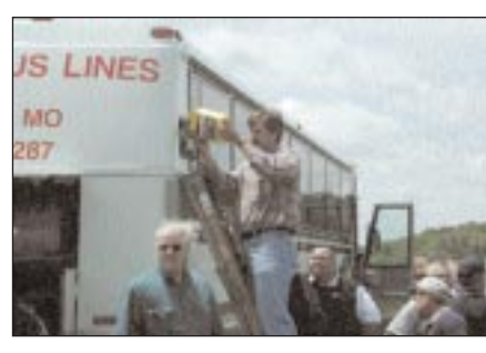
Our next stop was the Union Pacific Car Shop in De Soto, Mo. Along the way, we broke down. A few gallons of antifreeze later, and we were on our way.