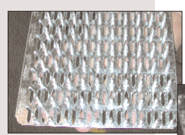
Crosstie end plates are engineered with single tooth stampings...and embossed with user information.